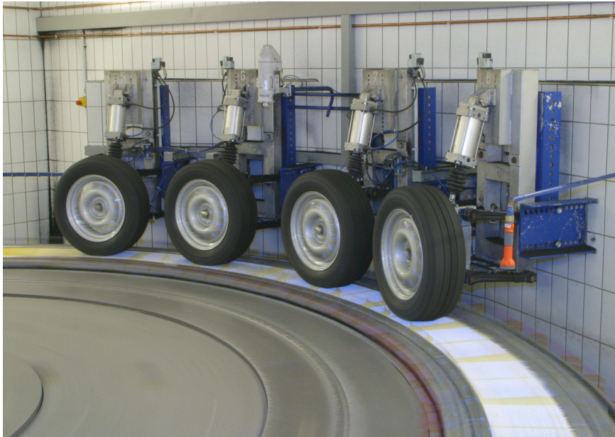
The turntable road-marking test system of the Federal Highway Research Institute (BAST)

Seeing and being seen are important preconditions for safety on the road. The latter particularly applies to road markings which can be considered as an essential element of visual guidance for the road user. Motorists (including motorcyclists), in particular, must be able to trust these road markings, both in the daytime and at night – and particularly in wet conditions.